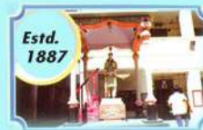
Dharmamurthi Rao Bahadur Calavala Cunnan Chetty's Hindu Higher Secondary School (Aided), Tiruvallur - 602 001.