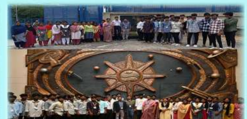
INDUSTIRAL VISIT - ISRO - Bengaluru Department of Electronics and Communication Science