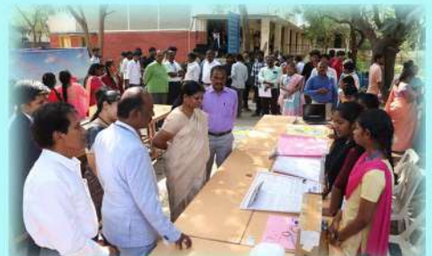
Cunnam Innovation Incubation Cell