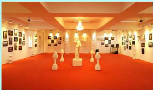
Cunnam Gallery (Vis.Com)