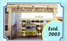
Calavala Cunnan Chetty's Hindu Matriculation Higher Secondary School (Self Financing) Kakkalur, Tiruvallur.