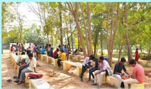
Boys Waiting Lounge