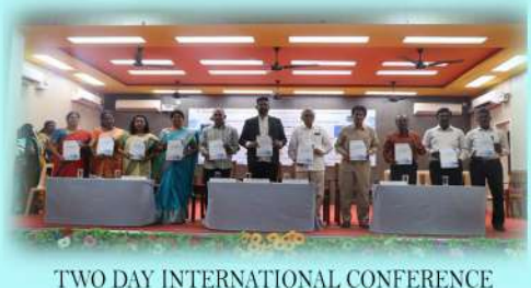
TWO DAY INTERNATIONAL CONFERENCE DEPARTMENT OF COMMERCE