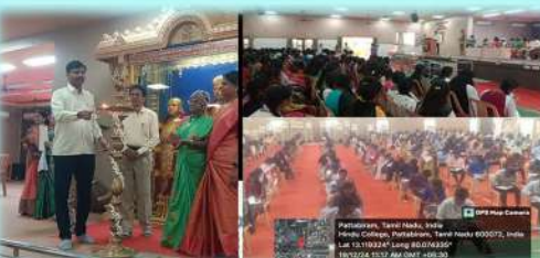
TNPS ORIENTATION PROGRAM BY COMMISSIONER, AVADI CORPORATION Preliminary aptitude test conducted by Competitive exam cell