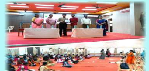
MAGALIR NALAM-HEALTHCARE PROGRAM BY GENDER CELL