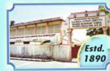
Dharmamurthi Rao Bahadur Calavala Cunnan Chetty's Higher Secondary School (Aided), Perambur.