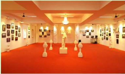
Cunnan Gallery (Vis.Com)