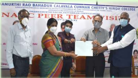
NAAC Peer Team