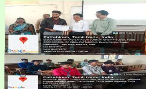
Yoga and Meditation