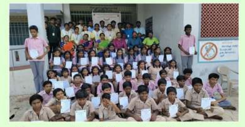
Community Education Programme