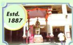
Dharmamurthi Rao Bahadur Calavala Cunnan Chetty's Hindu Higher Secondary School (Aided), Tiruvallur - 602 001.