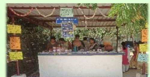
ED Cell Counter