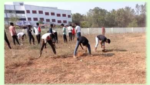
NSS Village Camp