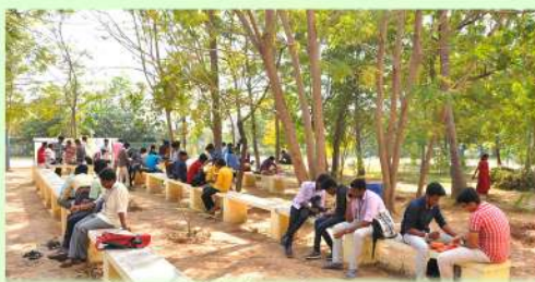
Boys Waiting Lounge