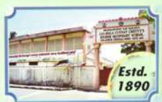
Dharmamurthi Rao Bahadur Calavala Cunnan Chetty's Higher Secondary School (Aided), Perambur.