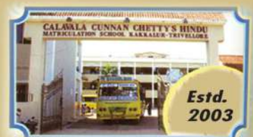
Calavala Cunnan Chetty's Hindu Matriculation Higher Secondary School (Self Financing) Kakkalur, Tiruvallur.