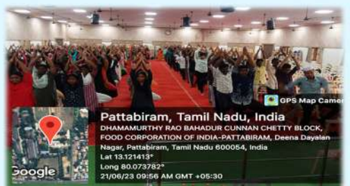
Yoga and Meditation