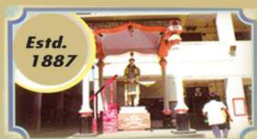
Dharmamurthi Rao Bahadur Calavala Cunnan Chetty's Hindu Higher Secondary School (Aided), Tiruvallur – 602 001.