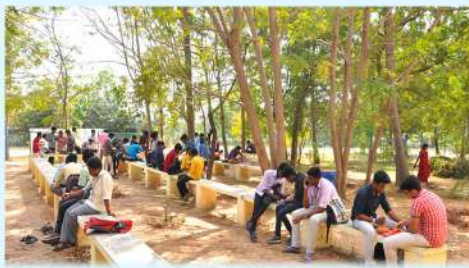
Boys Waiting Lounge