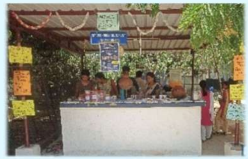
ED Cell Counter