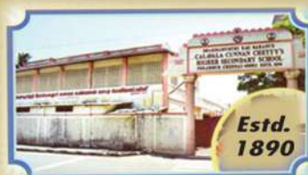
Dharmamurthi Rao Bahadur Calavala Cunnan Chetty's Higher Secondary School (Aided), Perambur.