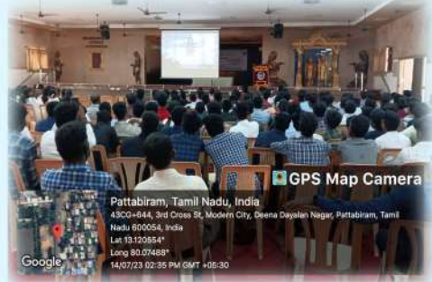
Chandrayaan 3 Launch