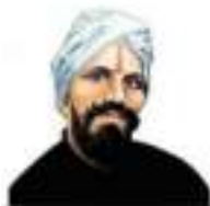
Educate the poor Mahakavi Bharathiyar