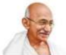
Develop the villages Mahatma Gandhi