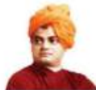
Feed the hungry Swami Vivekananda